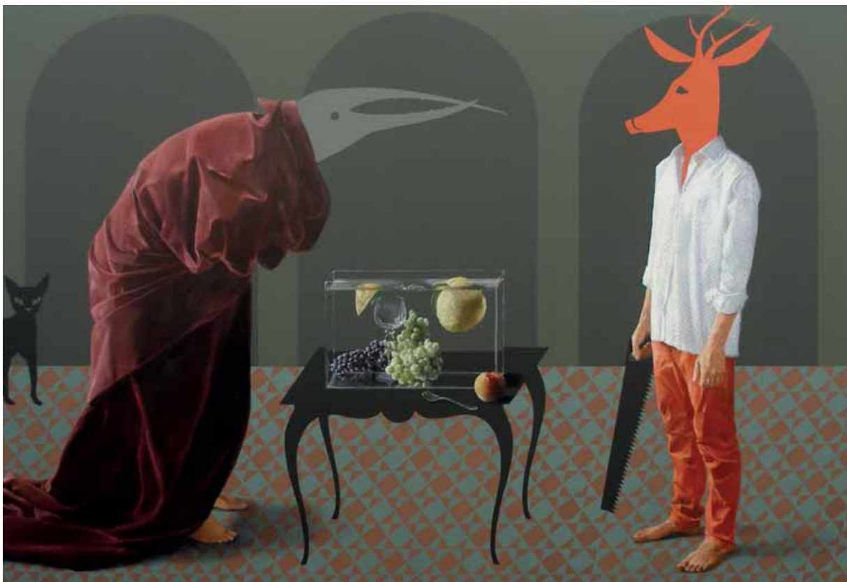
Máté Orr: I'm Here on Account of the Wood