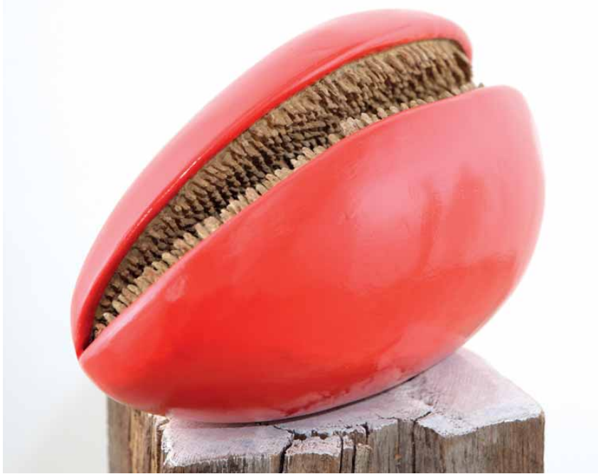
Gábor Fülöp: Urushi III.